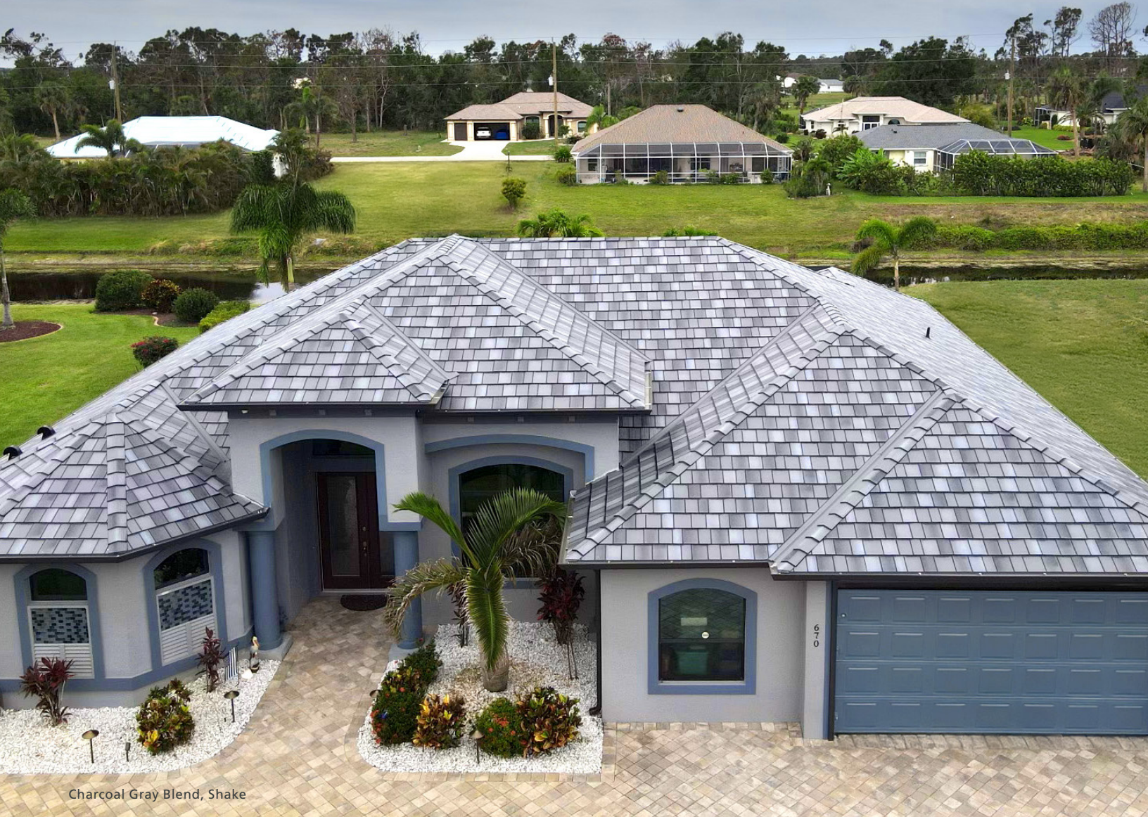
Charcoal Gray Blend, Shake

ABOUT EDCO With over 75 years of trusted expertise and an unwavering commitment to excellence, EDCO Products combines elevated design and exceptional craftsmanship, delivering premium Siding, Roofing, Soffit, Fascia, Trim, and Rainware products that are as beautiful as they are durable.