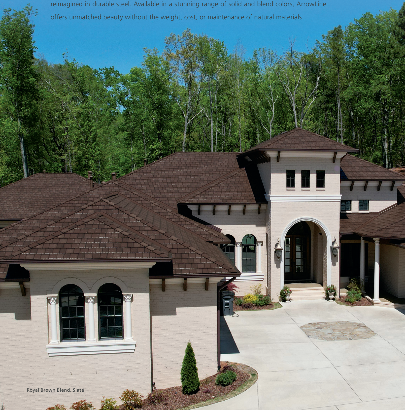
Royal Brown Blend, Slate

Experience the timeless elegance of hand-split cedar shakes or the refined allure of slate, reimagined in durable steel. Available in a stunning range of solid and blend colors, ArrowLine offers unmatched beauty without the weight, cost, or maintenance of natural materials.