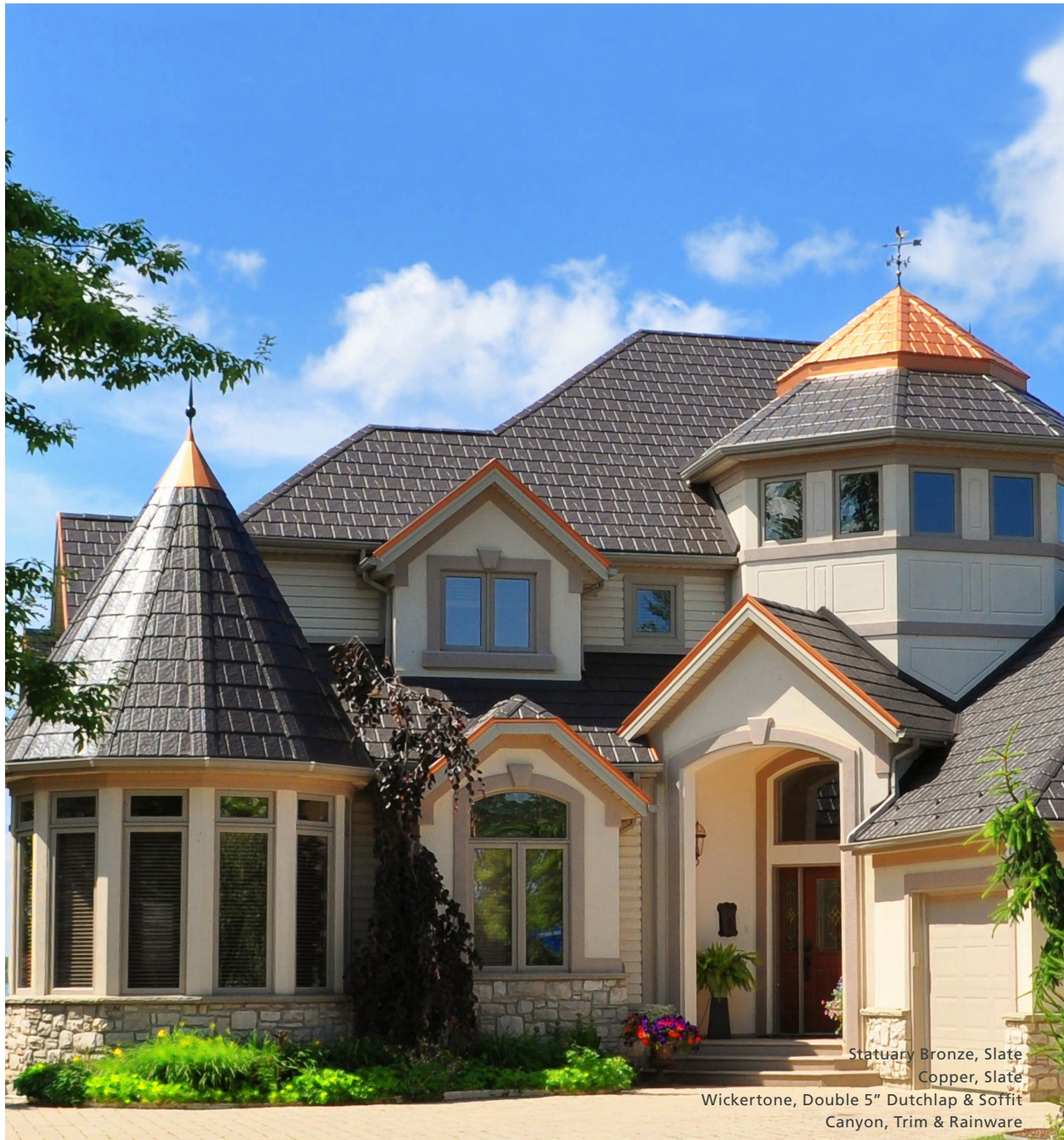
Statuary Bronze, Slate Copper, Slate Wickertone, Double 5" Dutchlap & Soffit Canyon, Trim & Rainware