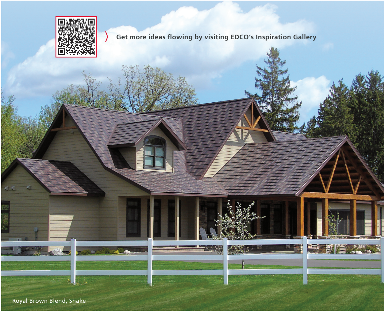
Royal Brown Blend, Shake

> Get more ideas flowing by visiting EDCO's Inspiration Gallery