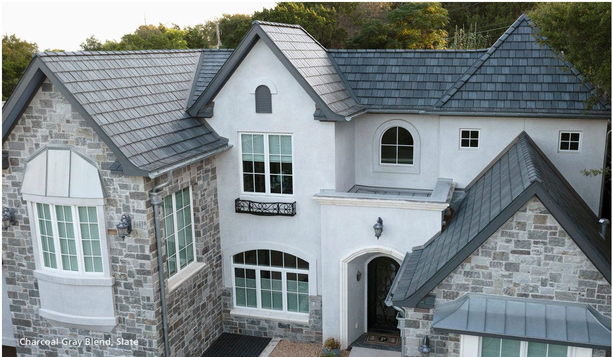
Charcoal Gray Blend, Slate