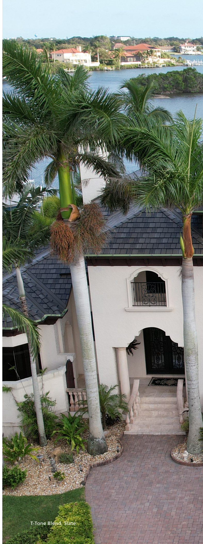
T-Tone Blend, Slate

EDCO's 4-way interlocking system delivers unmatched durability and protection, while ArrowLine's cutting-edge, cool-roof coating technology reduces heat absorption to boost energy efficiency.