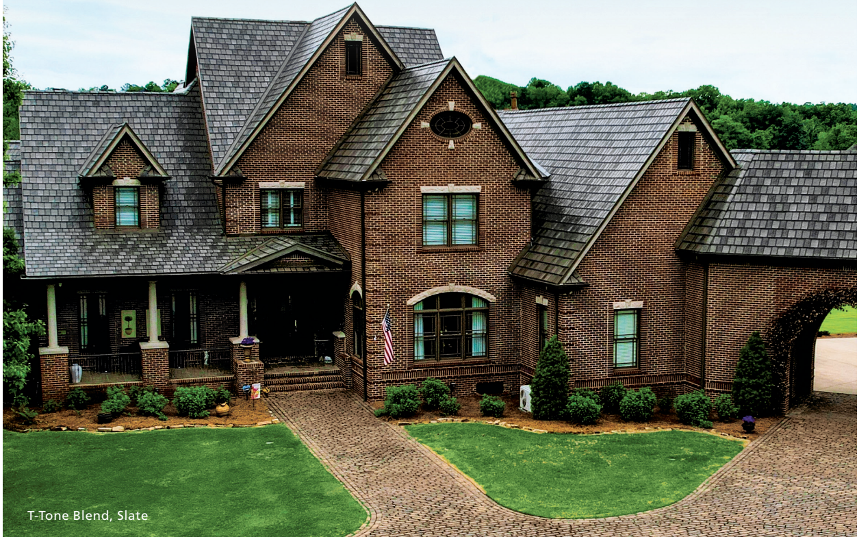
T-Tone Blend, Slate

> Get more ideas flowing by visiting EDCO's Inspiration Gallery