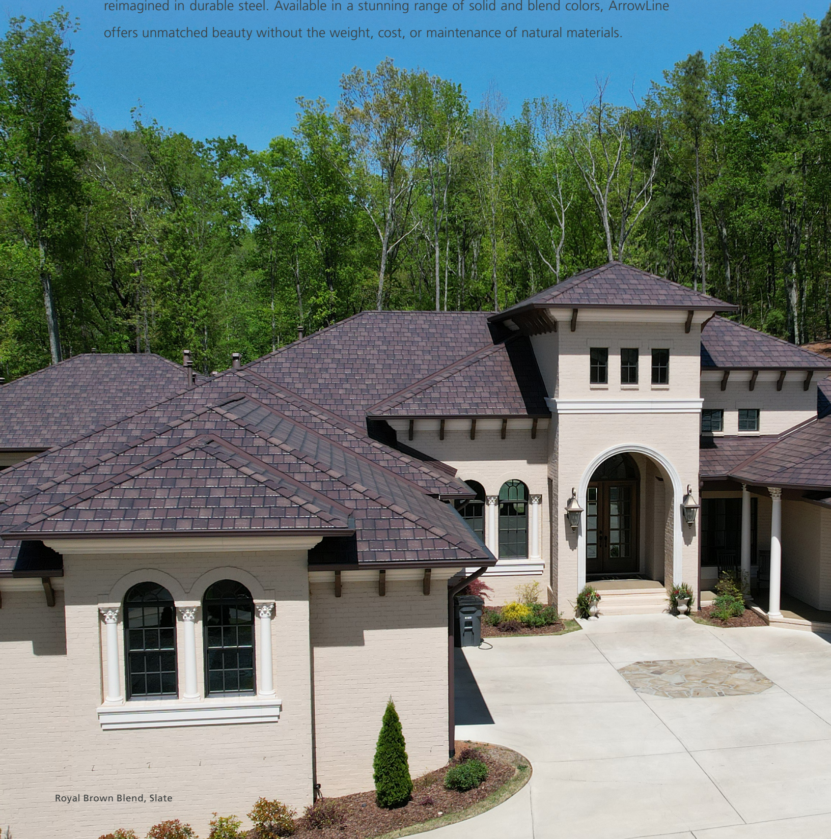
Royal Brown Blend, Slate

Experience the timeless elegance of hand-split cedar shakes or the refined allure of slate, reimagined in durable steel. Available in a stunning range of solid and blend colors, ArrowLine offers unmatched beauty without the weight, cost, or maintenance of natural materials.