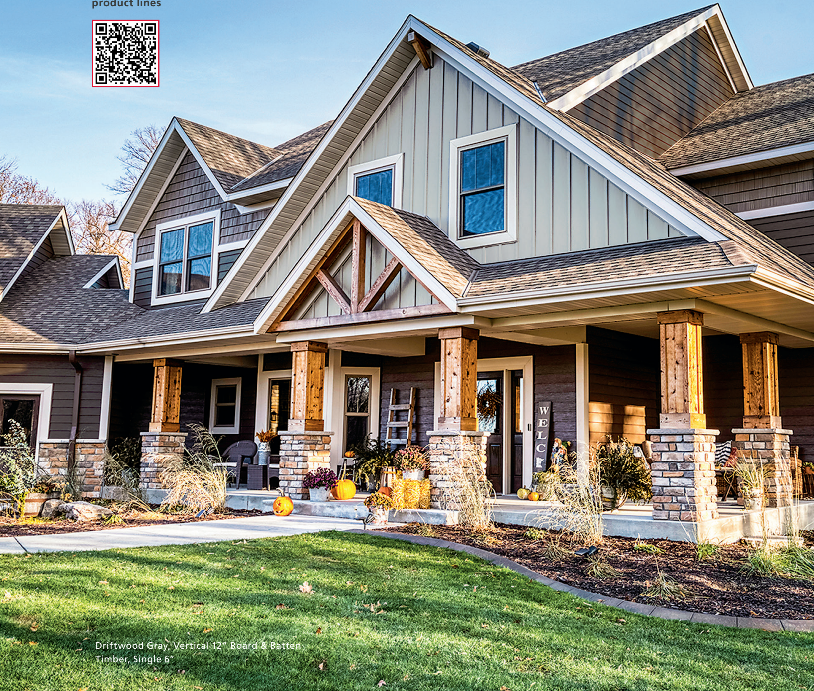
Driftwood Gray, Vertical 12" Board & Batten Timber, Single 6"

ABOUT EDCO With over 75 years of trusted expertise and an unwavering commitment to excellence, EDCO Products combines elevated design and exceptional craftsmanship, delivering premium Siding, Roofing, Soffit, Fascia, Trim, and Rainware products that are as beautiful as they are durable.