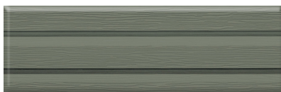
Double 5" Dutchlap